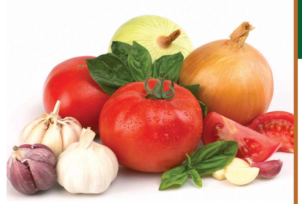
EM•1® Effective Microorganisms® is a safe, nature-grown solution that: